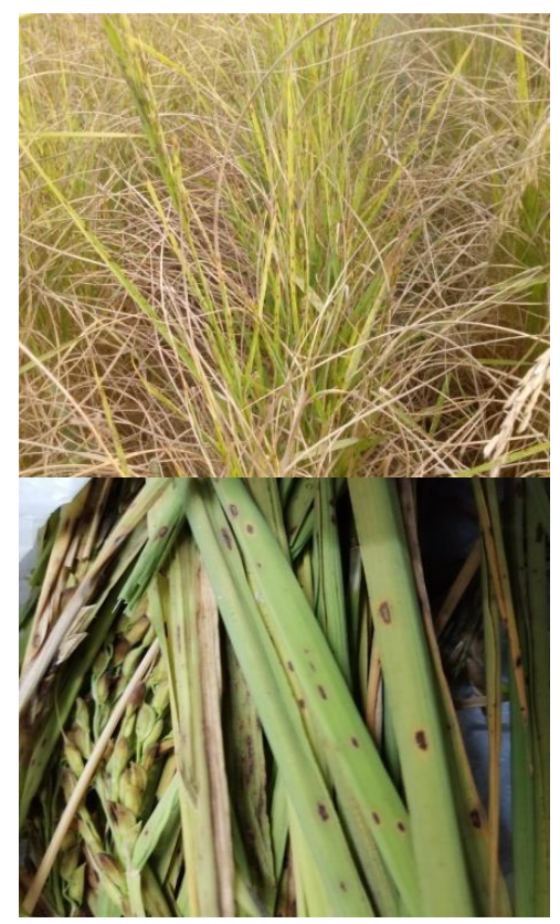
Figure 1. Symptoms of brown leaf spot of rice.

Nutrients are vital for strengthening of plant cell walls and their normal growth which helps to reduce the disease severity (Huber and Graham, 1999). An appropriate availability of nutrients triggers the resistance mechanism of the host plants against pathogens; while, their deficiency makes the plant vulnerable to disease by changing the physiology and biochemistry of the plants. These changes are i.e. influence on growth pattern, chemical composition, decrease resistance and antioxidant defense capacity of plant (Hajiboland, 2012). Type of disease, amount of mineral elements, the form of elements and climatic conditions are also important factors to determine their effects on the disease development. Minerals are the crucial part of plant nutrition and their deficiency/ excessive amount cause certain types of maladies by disruption of metabolism process/ physiology of the plants by favoring plant pathogens or disturbing plant growth mechanism (Sahi et al., 2010). The plants which are scarce nutrients are more prone to disease as compared to nutrient deficient. The pathogen damage is compensating by a specific nutrient that reduces the disease through tolerance. The disease BLS incidence and severity influenced by different mineral nutrients i.e. Nitrogen, phosphorus, manganese, iron, and calcium (Ou, 1972).