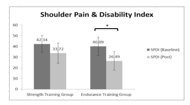
Fig 1: Comparison of Mean & Standard Deviation of Shoulder Pain & Disability Index after Treatment across Groups

Above table shows that after applying intervention significant improvement was seen in endurance training group with p value <0.05.