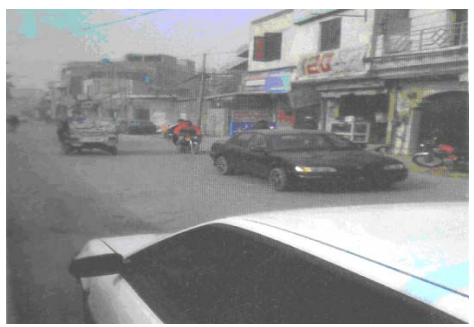
Figure 4: Existing Traffic situation in Saidpur Road