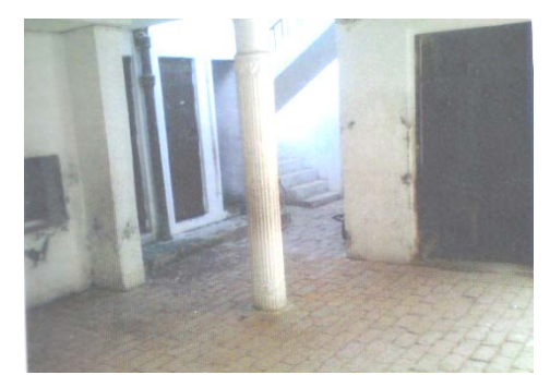
Figure 3: Interior view of residential building that is being used as School 2

Table 6 shows that speech intelligibility of students (83%) is the highly prevailing problem in the classroom. The data also provides evidence that speech intelligibility and learning ability are the most affected components. Such noise conditions prevailing in the schools ultimately generate lack of concentration and cause tiredness.