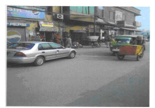
Figure 1: Commercial activity with traffic situation

The measurement of noise level has been made at different locations in school. Sound level