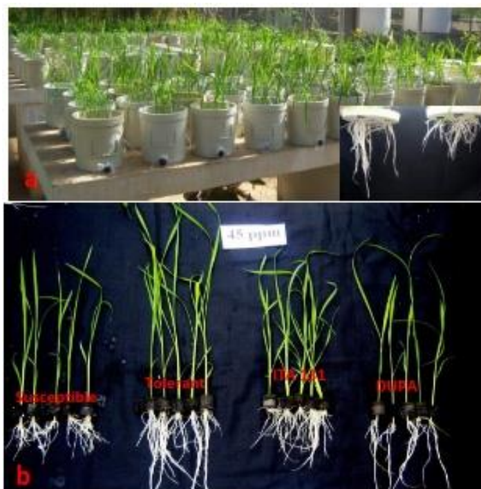
Figure-2. The experiment of Al stress on Yoshida nutrient solution (a); the root lengths of ITA 131 (susceptible check), and DUPA (tolerant check) under 45 ppm (b)

Root shortening is one of the consequences of Al inhibition; therefore, its structure appeared to be shorter, fat, and reduced branching, while its adventitious roots grew the more (Figure 2a). The roots have hardly penetrating the soil layer also inhibit nutrients and water absorption. The toxicity level depends on the concentration of Al^{+3} ions in the soil solution. Al decreased the fresh weight by inhibiting the absorption of water and mineral substances (Qian et al., 2018).