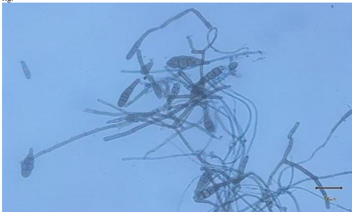
Fig.1 Microscopic view of Alteria porri causing purple blotch of onion.

Light to dark olivaceous and grayish white colonies with concentric rings were appeared. Colony margins were complete, irregular, and wavy with fluffy and velvety texture while conidial shape was straight to curve along with light to deep brown colour which confirms the existence of A. porri . The number of horizontal and vertical separation in the conidia ranged from 3.00 to 6 µmm as shown in fig.