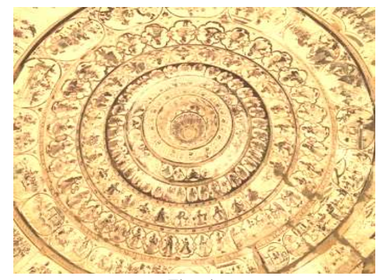
Fig: 4: Ceiling of pillar hall of Gori temple

According to Jain belief the universe was neither created nor will it cease to exist. The universe is circular and has no beginning and no end, it moves like the wheel of a cart. It had an infinite number of time cycles before the present era, after this age there will be an infinite number of time cycles also. So that in these temples there are mostly domes with numerous cycles. Every ring in the dome of the Gori temple shows the life cycle of human beings looking at the ceiling of the front pillar hall where there are ten panels / bars. Every panel is different from other circlesand the decoration begins from nucleus spot of the total painted circles. Each circle is described in detail as under.