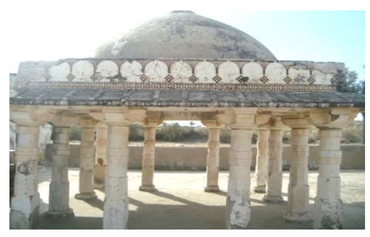
Fig: 3 View of Pillar hall of Gori temple

The purpose of the paper is to explore the outer look of the dome/canopy which is situated at the entrance of the Gori temple and it is full of paintings. There are 12 ornamented pillars in quadrangle shape constructed with limestone and plastered with lime plaster. The quadrangle pillars at one meter above the ground become octagonal and then these are in round shape. These pillars have also two bands / strips on which flowers are embossed in a rectangular shape. The arches are with bracket capitals, after this, it has a battlement parapet around the dome and then it has onion shape / Muslim style dome in plain and round shape from outside. Whereas from inside it is constructed as a corbelled roof and having ten circles, every circle was separated with dark brown color strip, every strip/ circle is painted with different pictures.