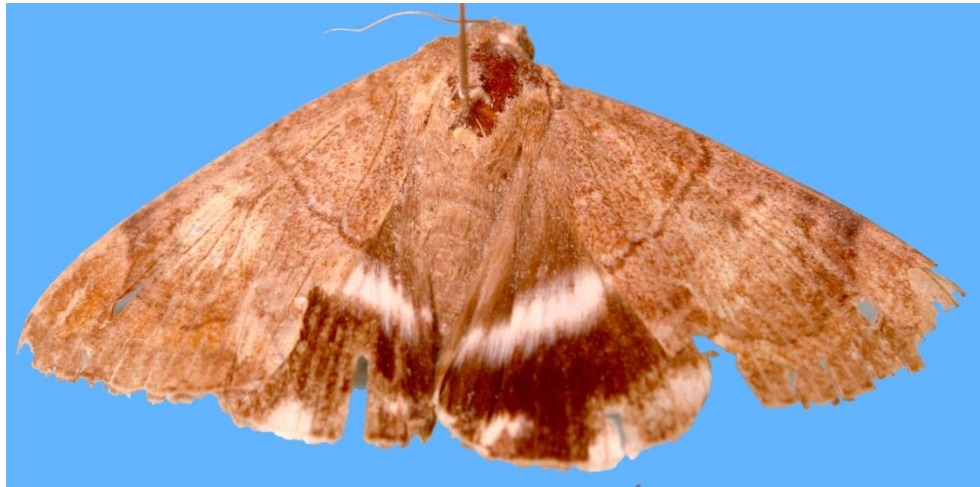
Fig. 1. Entire specimen Achaea janata .