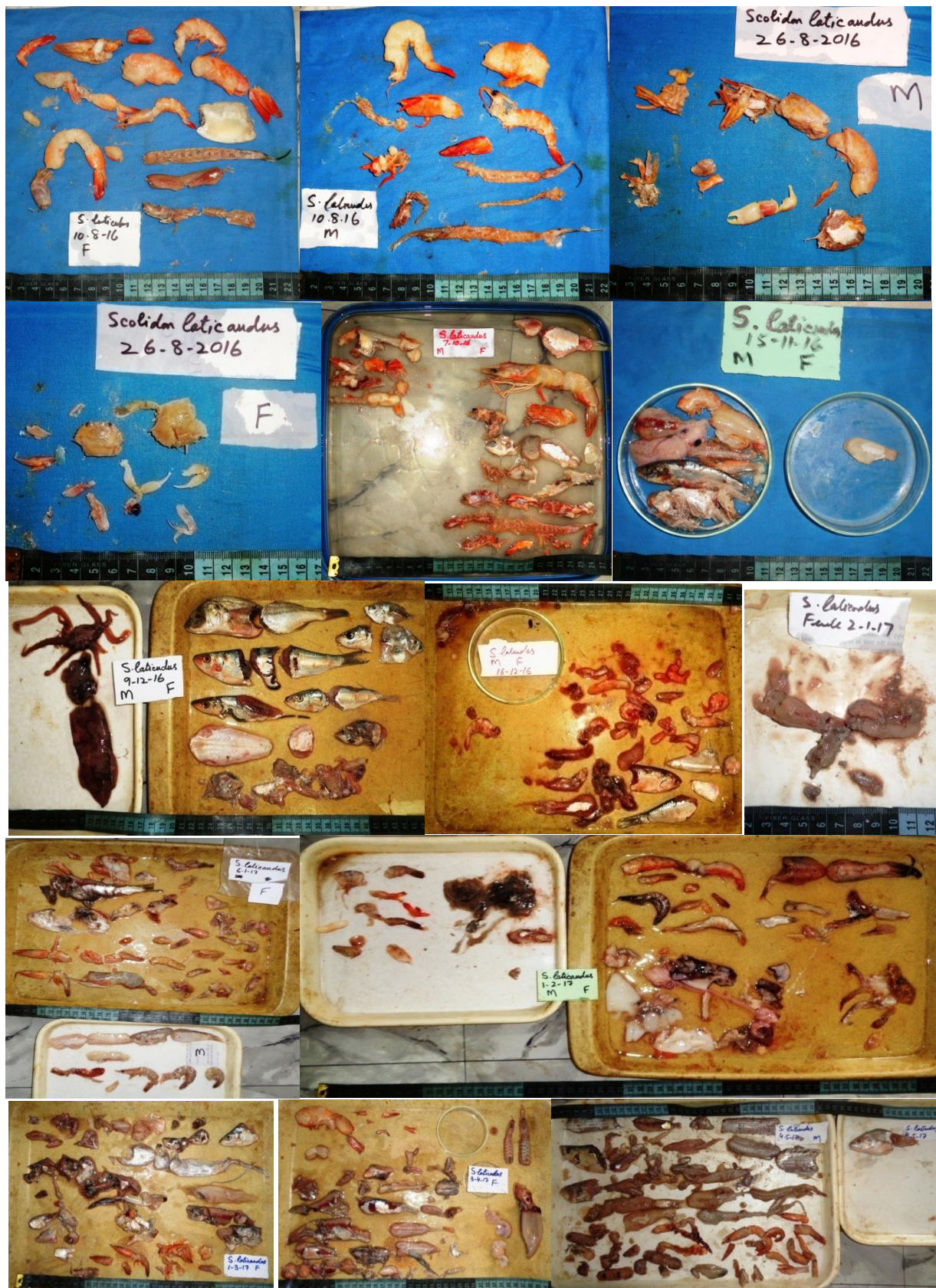
Plate.3. Food variety of different months.