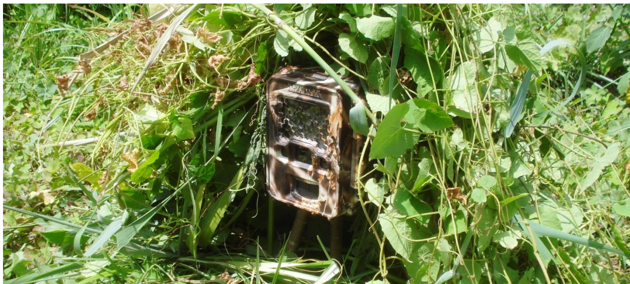
Fig. 2. Camera traps installed for capturing photos.