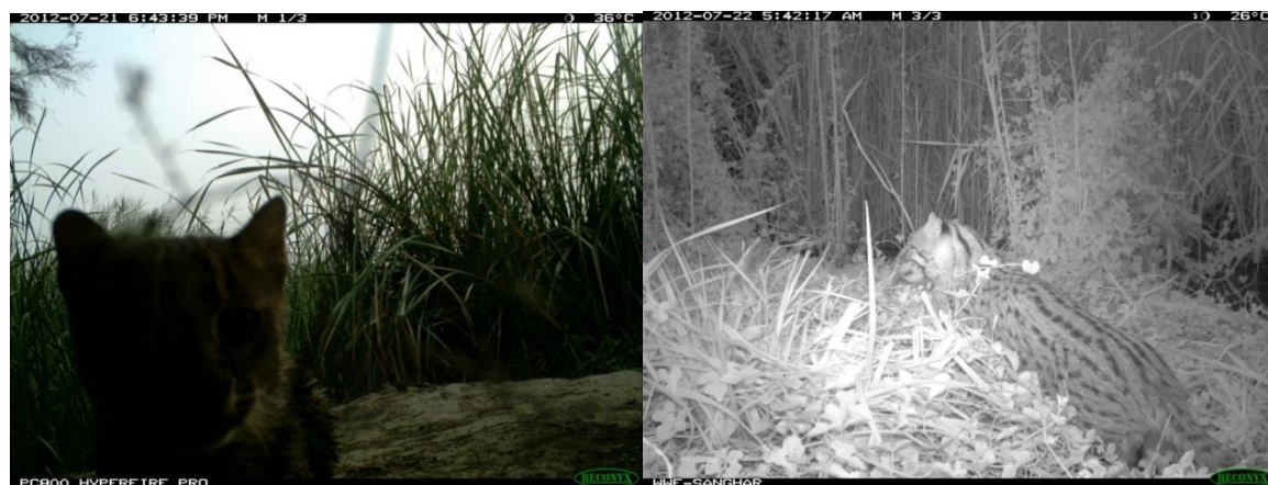
Fig. 3. Camera trap # 3 & 4 showing fishing cat.