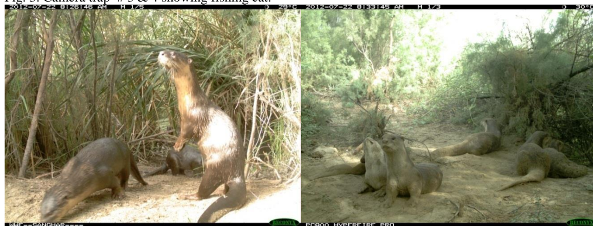
Fig. 4. Camera traps # 1 & 2 showing smooth-coated otter).