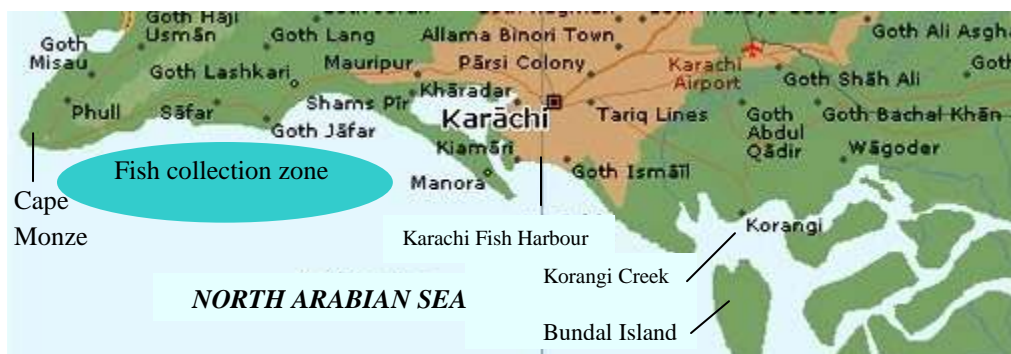
Figure 1A: Coastal area of Karachi – fish collection area in North Arabian Sea.

The contents of selected heavy metals in Karachi seawater are presented in Table 1.