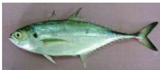
Figure 1B. An individual of Megalaspis cordyla from Karachi Coast, Pakistan.