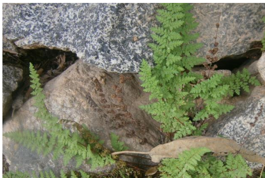
10. Cheilanthes acrostica L.