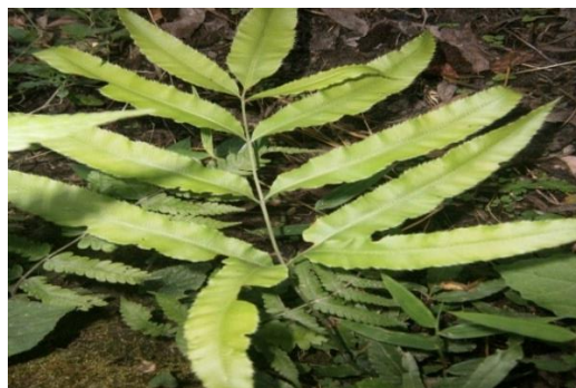
4. Pteris cretica L.