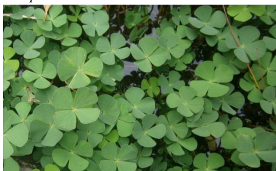
5. Marsilea quadrifolia L.