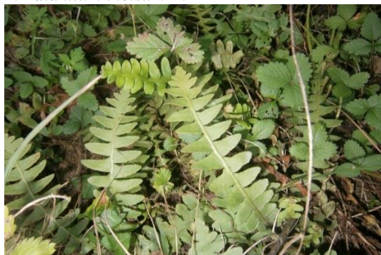
3. Asplenium alternans Wall.