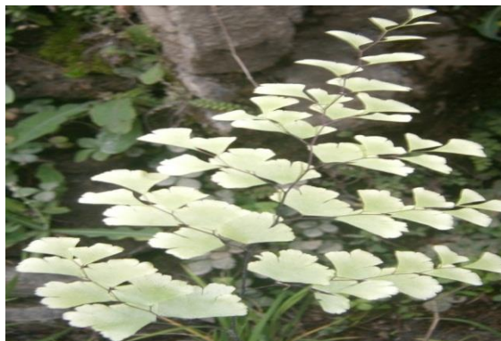
7. Adiantum capillus-veneris L.