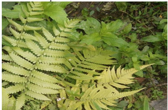
9. Dryopteris serrato-dentata (Bedd.) Hay.