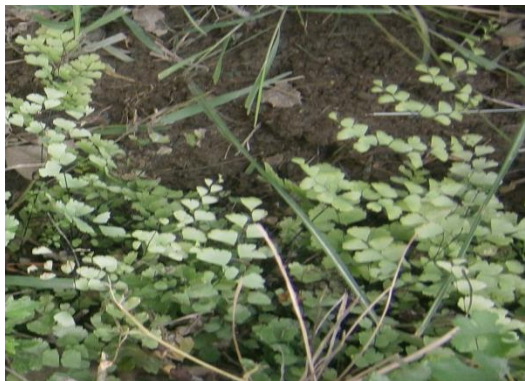
8. Adiantum venustum D. Don.