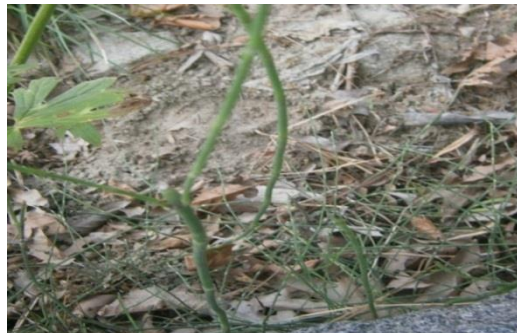
6. Equisetum debile Roxb.