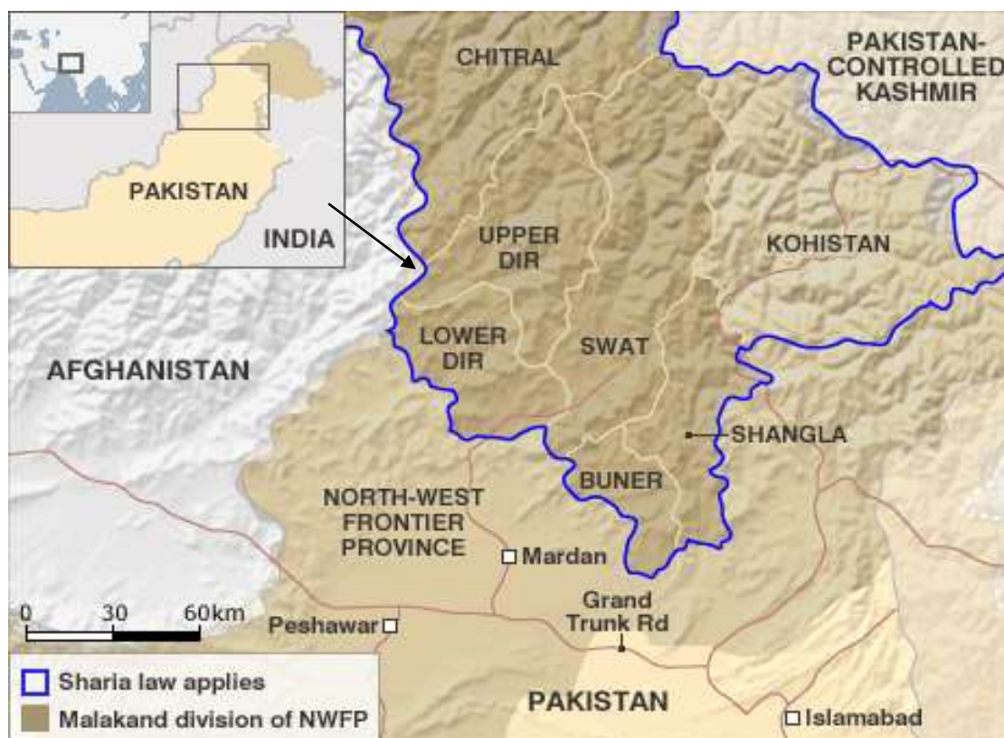
Fig.1. Map showing sampling site.

In herb shrub layer common species in all stands were Dodonea viscosa (L.) Jacq with 100% frequency in all stands. Otostegia limbata (Benth.) Boiss (40-80% frequency) Indigofera gerardiana (50 to 70%) Mallotus philippensis Mule (20-60%), Fragaria nubicola (20 to 60%), Geranium rotundifolium (20 to 50%) were dominant herb and shrubs. The least dominant species were Justicia adhatoda L. (20-40) and Artemisia vulgaris L., (30-70). Other species on the forest floor were Ajuga bracteosa Wall.ex Benth., (10-30), Rumex hastatus D.Don. (10-90), and Oxalis corniculata L., with (40-90) frequency. The distribution pattern of most of the species was random and a few were distributed contagiously.