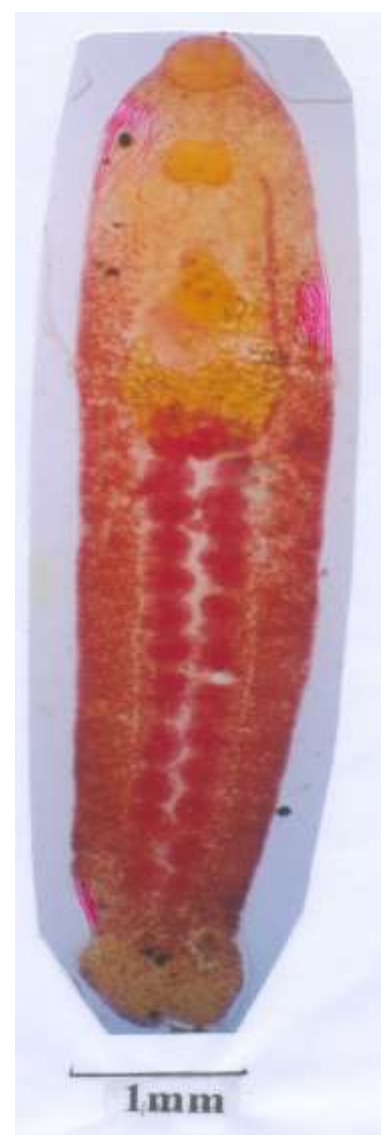
Fig.2. Photograph of Holotype specimen.

Diagnosis: Body smooth, elongate, almost uniformly thick throughout its length with a flattened rounded caudal appendage, notched at terminal end, slightly narrow anterior to caudal appendage. Body 7.3 – 7.8 long, 1.3 – 1.5 wide including caudal appendage which is 0.62 – 0.64 by 1.0 – 1.2, greatest width at the ovarian region. Oral sucker terminal, projecting out, almost rounded, muscular, 0.29 – 0.31 by 0.40 – 0.41 in size, posteriorly surrounded by numerous granular cells. Prepharynx tubular 0.31 – 0.36 in length. Pharynx transversely elongate, 0.21 – 0.23 by 0.39 – 0.41 in size, slightly concave anteriorly and posteriorly, esophagus 0.21 – 0.25 long, bifurcating some distance anterior to acetabulum. Ceca long, smooth, anterolaterally directed diverticles are absent, ceca are also not diverculated laterally, ending blindly on each side of excretory vesicle at posterior end not extending in caudal appendage. Acetabulum rounded, small, 0.31 – 0.36 in diameter.