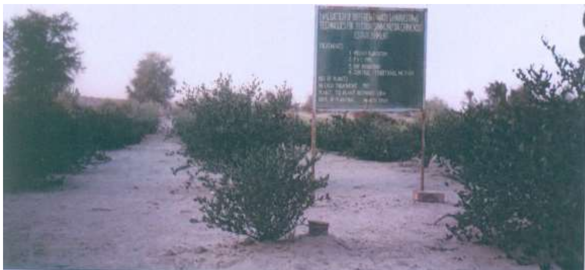
Fig.1. A view of growth response of Jojoba to different irrigation techniques on sand dunes at Cholistan experimental station of Arid Zone Research Institute, Bahawalpur.

In this treatment, 45 cm deep pits were dug and 15 cm depth (bottom) of the pits was filled with loose sand. Jojoba plant was placed on the top of the loose sand and a 45 cm long PVC pipe (6 cm dia.) was erected near the roots of the plant in such a way that one end of the pipe remained outside the pit. Pipe was inserted in a slanting position. After erecting the pipe and placing the plant, the pit was completely filled with the soil. The open end of the pipe was covered with a cap to avoid water losses. The watering to the plant was carried out through the open end of the PVC pipe. Losses of water due to transpiration are minimized in this technique. The water directly goes to the roots and is efficiently used by the plant.