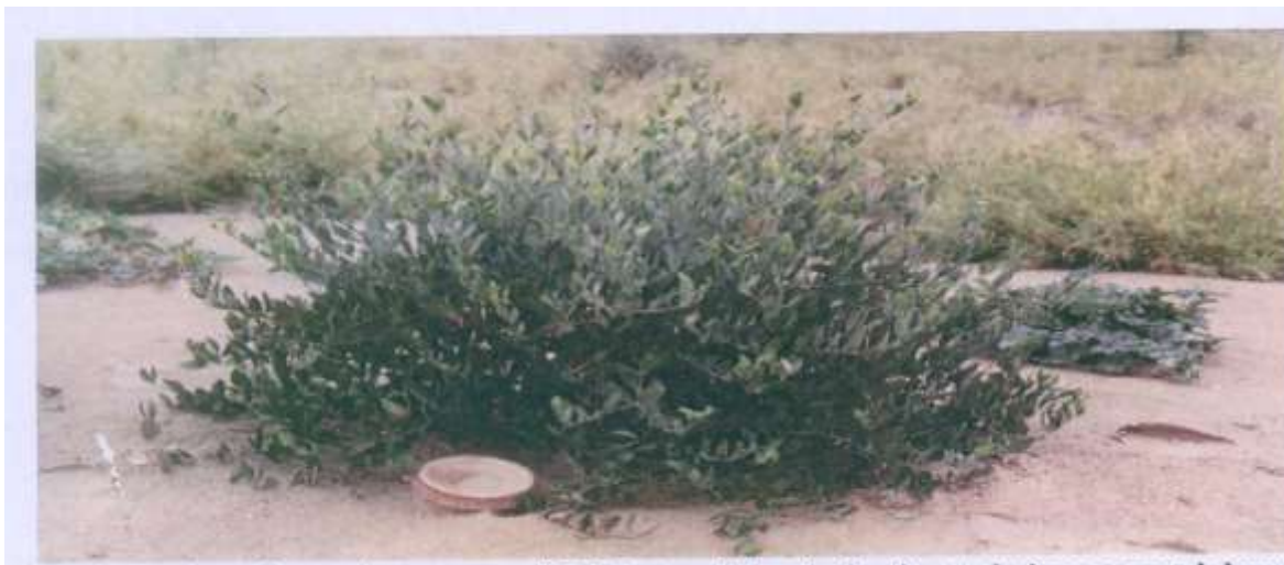
Fig.2. A view of growth response of Jojoba to pitcher irrigation technique on sand dunes at Cholistan experimental station of Arid Zone Research Institute, Bahawalpur.