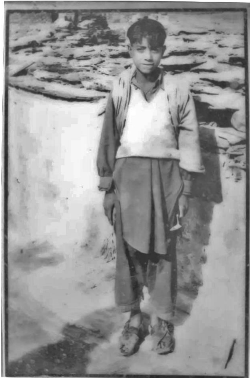
At Butkara I, 1957