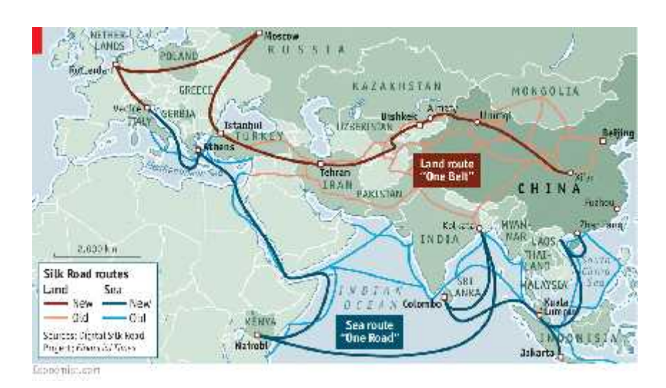
Source: <a href="http://www.economist.com/news/china/21701505-chinas-foreign-policy-could-reshape-good-part-world-economy-our-bulldozers-our-rules">http://www.economist.com/news/china/21701505-chinas-foreign-policy-could-reshape-good-part-world-economy-our-bulldozers-our-rules</a>

population". (A brilliant plan One Belt, One Road, 2015: CLSA). China has launched the Asian Infrastructure Investment Bank (AIIB) and set up a USD 40 billion for Silk Road Fund. The OBOR connects China with Central Asia, Middle East, Africa and Europe. "It is envisioned that the plan would knit much of Asia, Europe, Africa, and the Middle East closer through latest infrastructure and free trade zones." (Catanza et al. , 3 July 2015) Both plans are founded on the common pillars of economic centrality, infrastructure development, regional connectivity, unimpeded trade, inclusiveness and enhanced people-to-people ties.