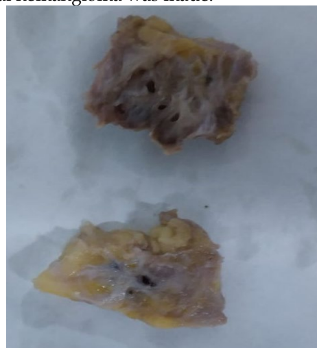
Figure 1: Gross picture showing tan brown lesion with cystic spaces

Based on the above-mentioned findings provisional diagnosis of bursal cyst was made. Elective surgical excision of the swelling was done in the surgical department and the specimen was sent to Histopathology department of Azra Naheed Medical College. Gross examination of the specimen revealed a tan brown soft cystic piece of tissue measuring 3.5x3x1cm. Cut surface was tan brown with small cystic spaces. Representative sections were taken and routine histopathological processing was done. Microscopic examination of hematoxylin and eosin stained sections revealed fragments of synovial membrane, hyalinized fibrous tissue comprising of a lesion having admixture of variable sized blood vessels and capillaries mostly arranged in lobular pattern. Thus, the histopathological diagnosis of synovial hemangioma was made.